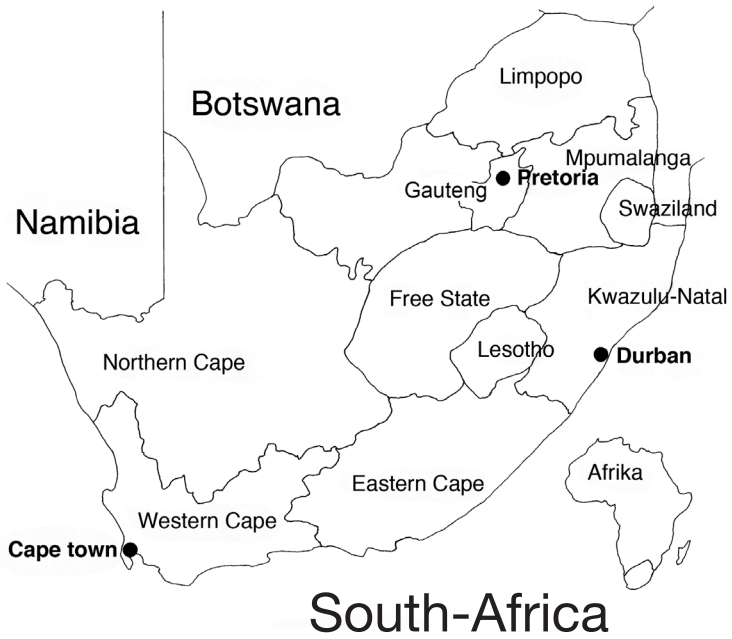
figure 1 - map of South Africa